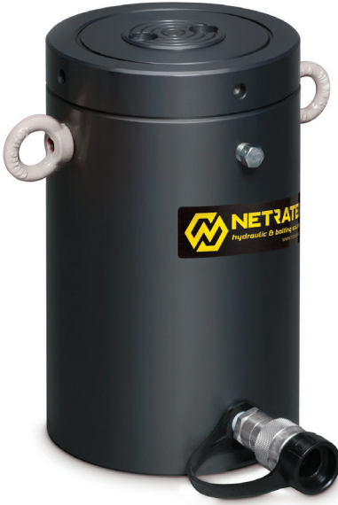
Oynar başlık opsiyoneldir Tilting saddle is optional